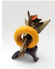
ACE (Yellow Donut with gold rocket) , 2021 glazed earthenware ceramic 19h x 24w x 18d cm. £1200 - Sold