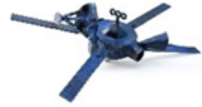
Out of the Blue , 2017 patinated blue bronze 50w X 30d X 24h cm. £12,000