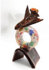
A SPRINKLE OF STAR DUST (Randy's Donuts) , 2022 glazed earthenware ceramic, 22h x 13w x 14d cm. £1200