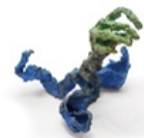
Thing , 2022 patinated bronze with Verdigris 19h x 20w x 19d cm. £3900