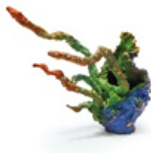
ADRIFI , 2022 patinated bronze 29w X 15d X 23h cm. £5000