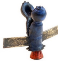
Soyuz , 2020 Patinated bronze 16w x 13h x 10d cm £1200