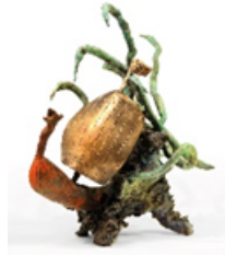
Scylla and Charybdis , 2020 patinated bronze 36w x 37h x 27d cm. £12,500