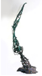
The Towering Crane , 2016 patinated verdigris bronze with wooden biplane 55w x 110h x 50d cm. £15,000