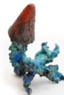
Space Pod , 2020 patinated bronze 13h x 9w x 9d cm. £1900