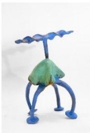
Drone , 2022 Patinated bronze. £800